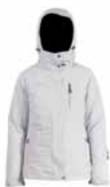
Silver / Silver Zip