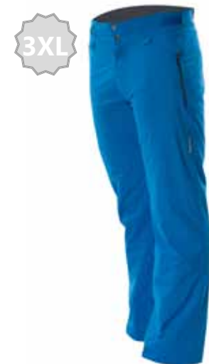
SS Blue - Ebony Zips