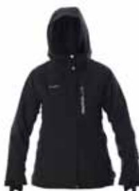
Black / Silver Zip