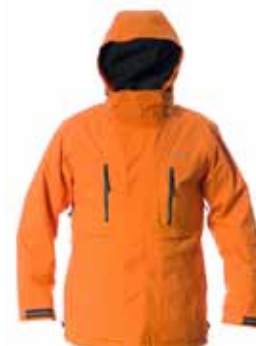
Orange Black Trims / Ebony Zips