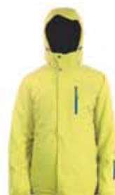
Lime / Notice Zips