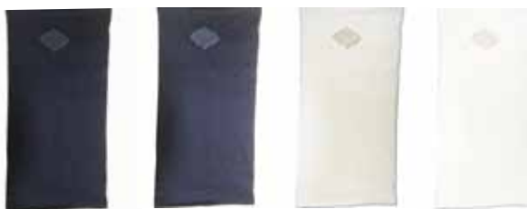
Black Ebony Silver White