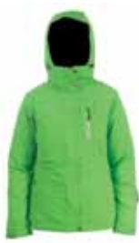
C.Green / Silver Zip