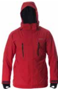
Red Black Trims / Ebony Zips