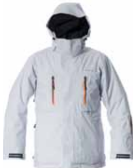
Silver Ebony Trims / Orange Zips