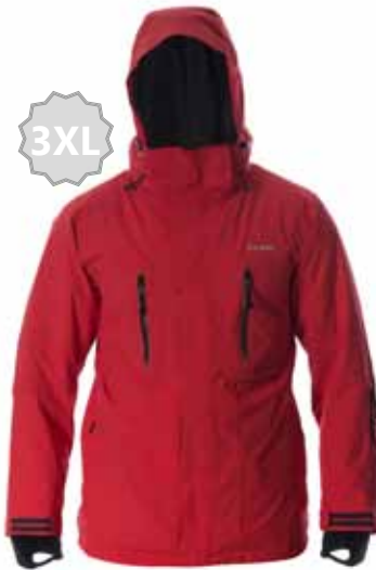
RED Black Trims / Ebony Zips