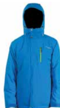
Notice / C.Green Zips