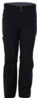
Black- Available in: Long / Regular / Short