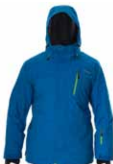
Notice / Green Zips