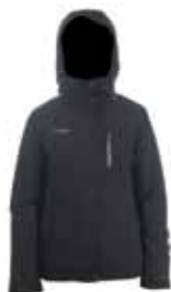
Black / Silver Zip