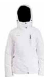
White / Silver Zip