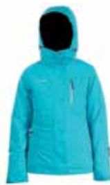
Tropic / Silver Zip