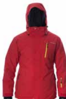
Red / Lime Zips