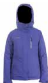
Purple / Silver Zip