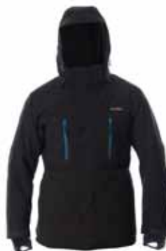
Black Notice Trims / Ebony Zips