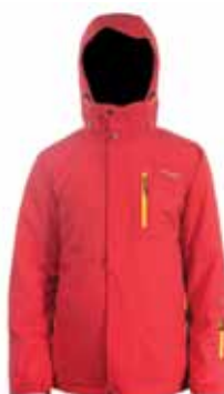
Red / Yellow Zips