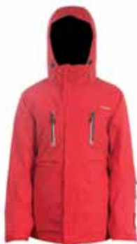
Red Navy Trims / Silver Zips