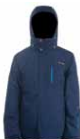
Navy / Notice Zips