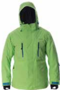
Green Black Trims / Notice Zips