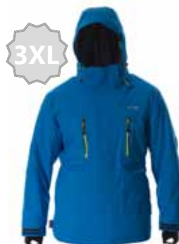
Notice Ebony Trims / Lime Zips