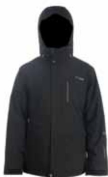
Black / Ebony Zips

Average approximate weight 964 g (784g without hood and powder skirt)