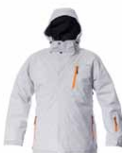
Silver / Orange Zips