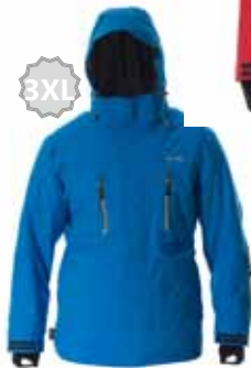
BLUE Black Trims / Ebony Zips