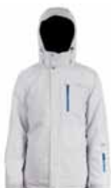
Silver / Notice Zips