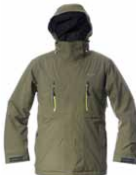
Khaki Ebony Trims / Lime Zips