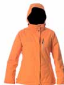
Orange / Silver Zip