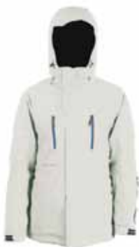
Silver Ebony Trims / Notice Zips