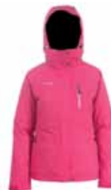
Raspberry / Silver Zip