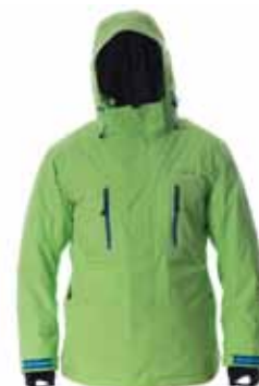
Green Ebony Trims / Notice Zips