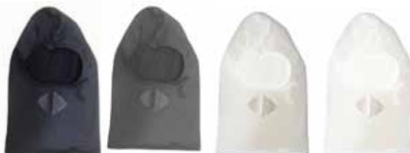
Black Ebony Silver White