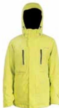
Lime Black Trims / Ebony Zips