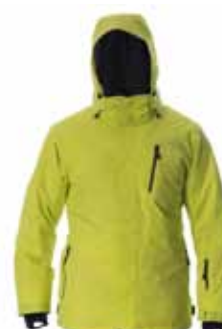
Lime / Ebony Zips