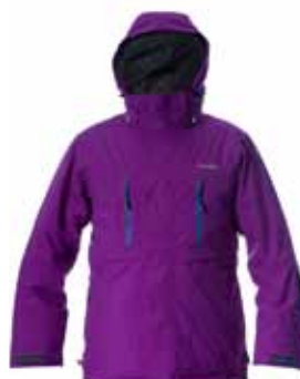
Grape Ebony Trims / Notice Zips