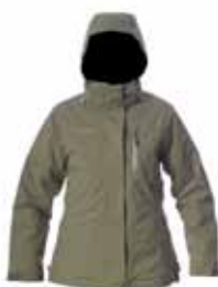
Khaki / Silver Zip