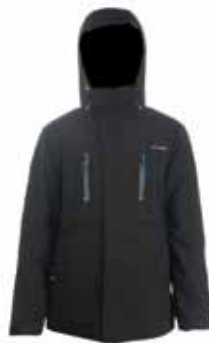
Black Notice Trims / Ebony Zips