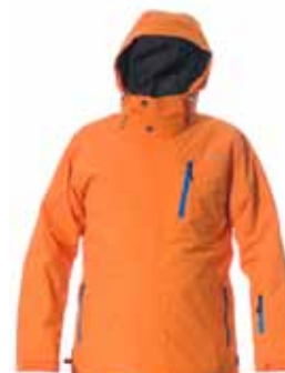
Orange / Notice Zips