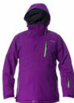
Grape / Green Zips