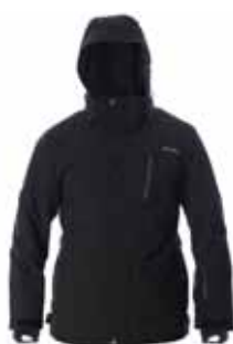
Black / Ebony Zips

Average approximate weight 964 g (784g without hood and powder skirt)