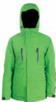
C.Green Black Trims / Notice Zips

Average approximate weight 990 g (810g without hood and powder skirt)