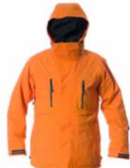
Orange Black Trims / Ebony Zips