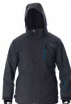
Ebony / Notice Zips