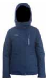
Navy / Silver Zip

Average approximate weight 829 g (667g without hood and powder skirt)