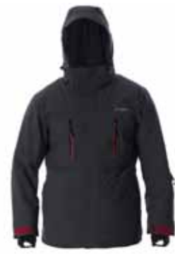
Ebony Black Trims / Red Zips