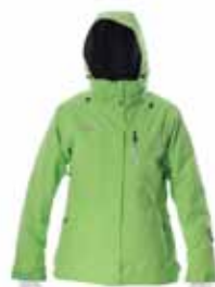
Green / Silver Zip