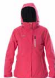
Raspberry / Silver Zip