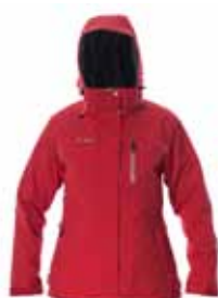
Red / Silver Zip

Average approximate weight 829 g (667g without hood and powder skirt)