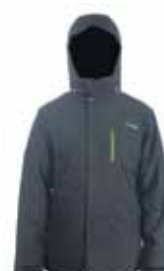
Ebony / Lime Zips