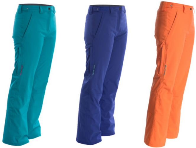
Teal Purple Orange