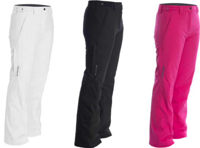
White Black Magenta